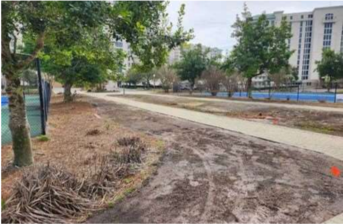
New palm trees, bushes, flowers and sod throughout the property.