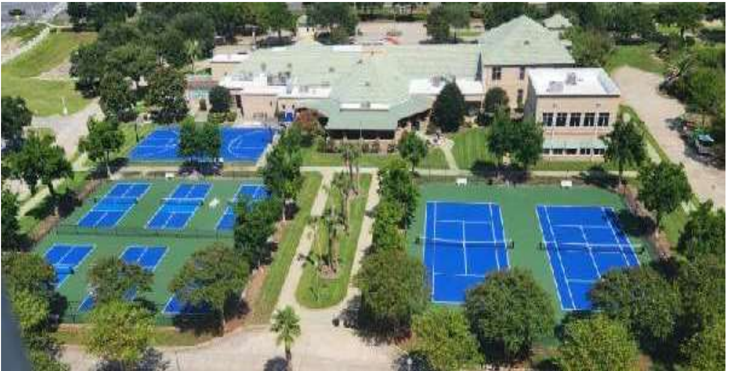
The pickleball, tennis, and basketball were resurfaced.