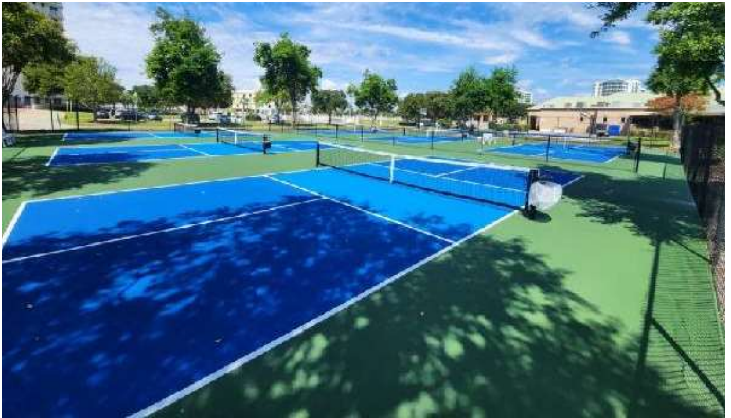
Silver Shells has 6 Pickleball courts and 2 Tennis courts.