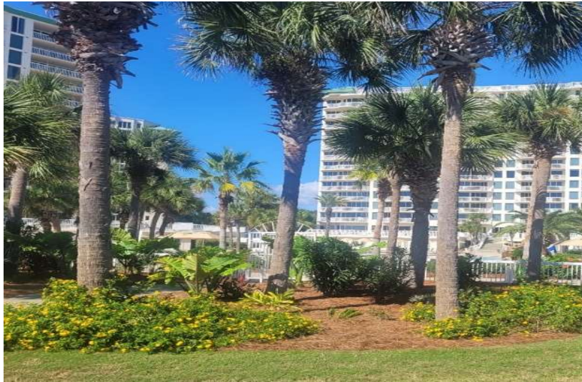
Flowers and pine straw add so much to the beauty of Silver Shells.